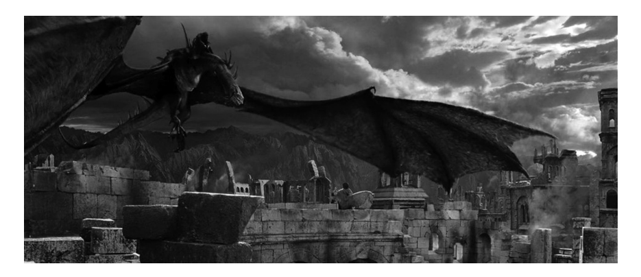
Figure 6.1 Facing a vastly (but not infinitely) greater foe: Frodo and the Nazgul.

prey. Frodo then wants to lose the burden of the Ring, tired of and desperate to escape from the entire situation in which he has found himself, and makes as if to give it to the king of the Ring-wraiths. Feeling undone by the overwhelming hostile external force that he does not realize he has himself called to him, he seeks for a moment to be rid of it that way, too.