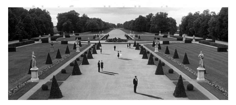
Figure 2.1 A life-world without nature, without materiality; without life, without world: Last year in Marienbad .

Marienbad, as I see it, demands to be read as an allegory of our civilization, inasmuch as it shirks the kind of possibility offered by Hiroshima (and by Gravity; and by Waltz With Bashir; and in a sense by most of the films in this book). It is a nightmare of reason. And reason as a nightmare. Bringing to mind G.K. Chesterton's great epithet:<sup>18</sup> that the madman is not the man who has lost his reason, but rather the man who has lost everything but his reason. This, I suggest, is the meaning of the sterility of the chateau and the gardens; and above all of the deeply puzzling way in which the film ends. Why can't the (anti-)hero and heroine get away when they finally decide to flee, after the tall thin man whose is the heroine's husband gives up on trying to stop them? Because they are stuck in a world where only the people, or (to be more precise) only their more or less Cartesian minds, are real, present. Thus the absence of anything but the people having true shadows, in one epochal scene in the film: X. I 1 3